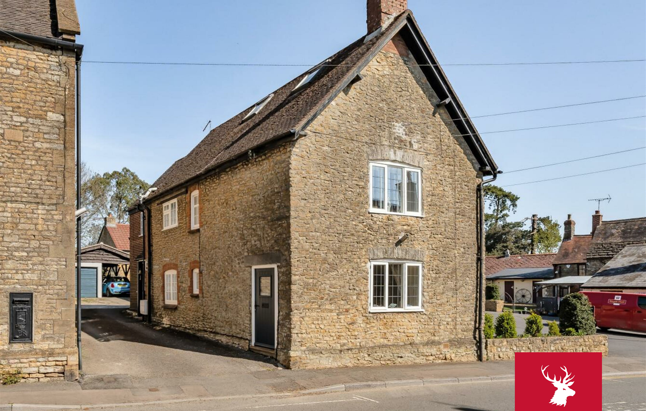
Wyke Cottage, 18, High Street